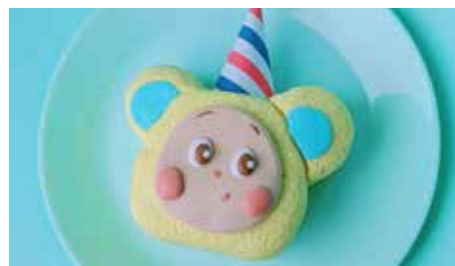
Character Cake Decorating