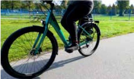
HUB Women's Cycling Program

HUB Cycling Outside - John Hendry Gravel Field Tu Jul 7-Aug 11 5:00 PM-7:00 PM $105/6 sess 602771