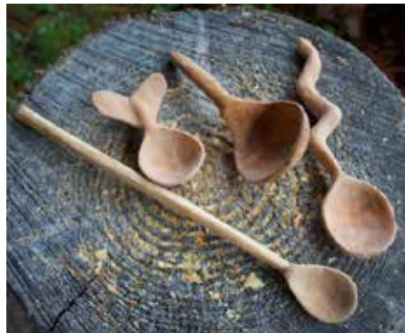
Spoon Carving 101