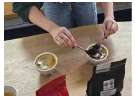
Brewing Methods: 1 Coffee, 3 Brewing Methods

Th Aug 13 5:00 PM-7:00 PM $31.50/1 sess 602910