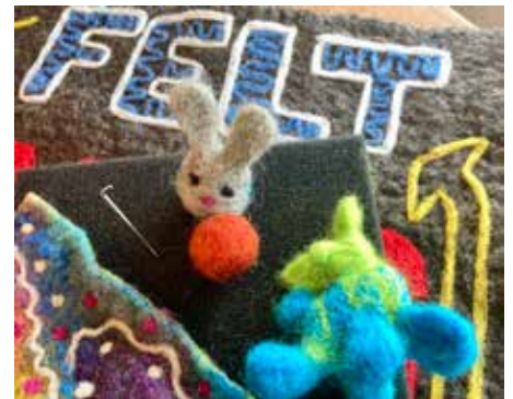
Wool Needle Felting

Amy Walker Lakewood Room Su Jul 5 12:15 PM-2:15 PM $44/1 sess 606277