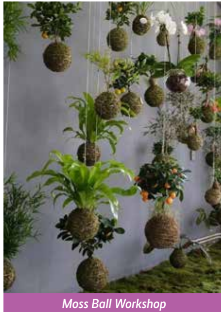
Moss Ball Workshop