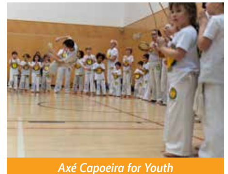
Axé Capoeira for Youth

(All Levels) Lakewood Room M Jul 6-Aug 17 5:15pm-6:15pm Elm Room W Jul 8-Aug 19 4:30pm-5:30pm $156/13 sess 608977