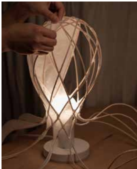
Rattan Paper Lamp Workshop

Yee Chan Lakewood Room W Apr 22-May 20 6:00 PM-8:30 PM $188/5 sess 607063