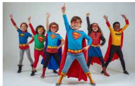
Superhero Training Academy Dance Camp

Endorphin Rush Dance Cedar Hall M-F Aug 17-Aug 21 12:30 PM-3:30 PM $220/5 sess 609328