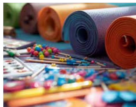
Yoga Dance and Art Camp

Kylie Railton Elm Room M-F Aug 10-Aug 14 9:00am-3:00pm $285/10 sess 609102 M-F Aug 24-Aug 28 9:00am-3:00pm $285/10 sess 609103