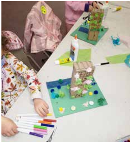
Pro-D Day with Petit Architect

Board Room M Apr 20 9:15am-2:45pm $115/1 sess 598474