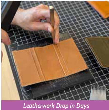
Leatherwork Drop in Days