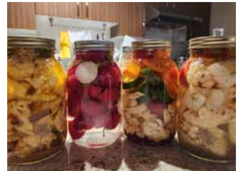
Lacto Fermented Pickles & Bahn Mi Workshop

Kristine Hui Kitchen Su Aug 16 1:00 PM-3:30 PM $67/1 sess 603674