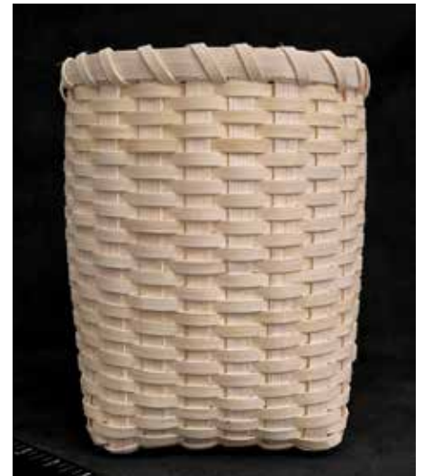
Basket Weaving 101

Suzanne Cowan Su May 24 $136.50/1 sess Art Studio 10:00 AM-3:00 PM 600025