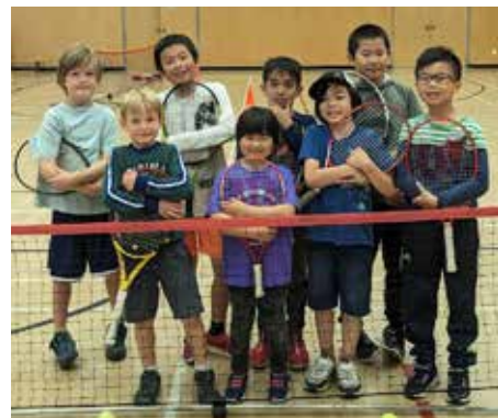
Kids Team Tennis Camp