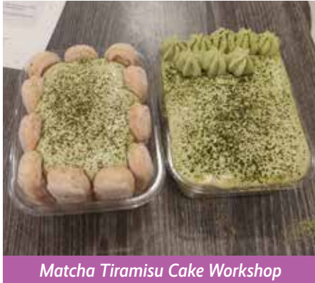
Matcha Tiramisu Cake Workshop